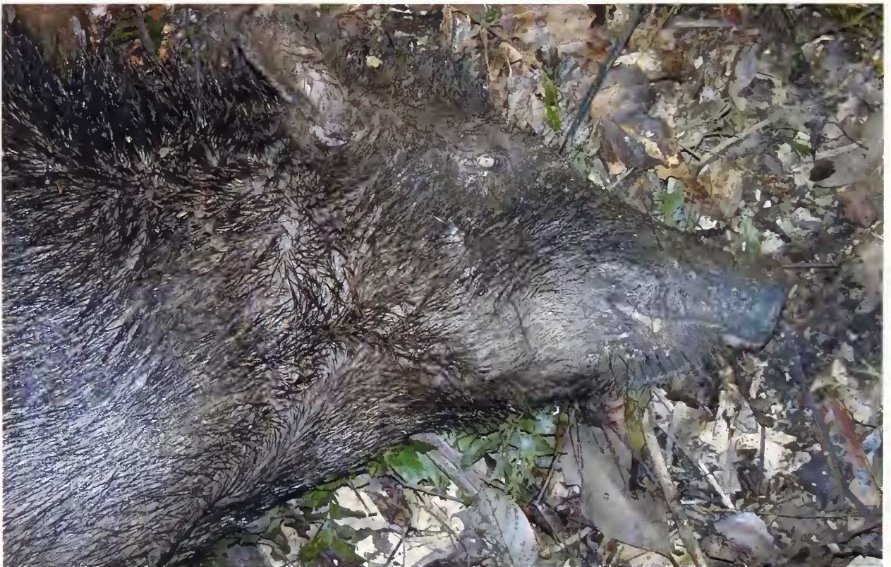
Fig. 2. Lateral view of the head of the same specimen.